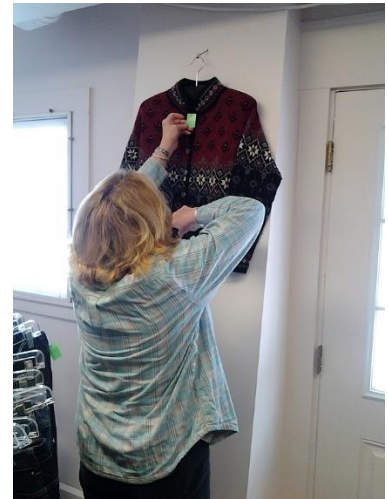
Someone special will own this beautiful sweater