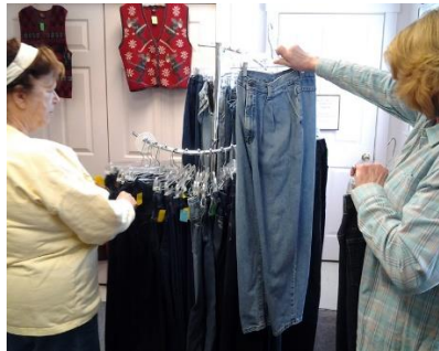
So many jeans to choose from, men's & women's