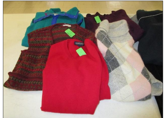
Sweaters and vests

*** There is no Tuesday Edgecomb Community Lunch during the month of February