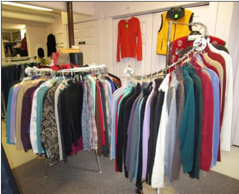
Many Sweaters & Turtlenecks

*** Winter Clothing $1 each Sale - The Edgecomb Thrift shop is having a winter clothing sale now through March 20, 2018 including sweaters, jackets, coats, and pants & more. The thrift shop will be open regular hours weather permitting: Tuesdays 9-1, Thursdays 1-4, and Saturdays 9-12 noon, as well as during coffee hour after worship on Sunday mornings.