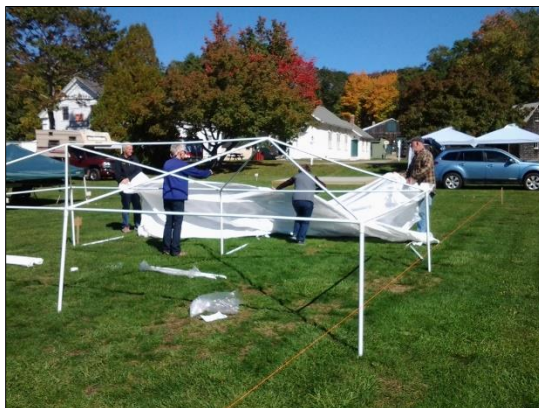
Putting up the roof!