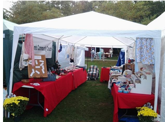
The tent is up – ready to sell!