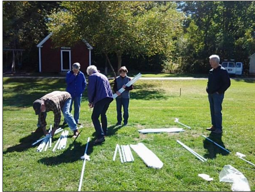
Counting the tent poles!

Fall Foliage Festival at the Boothbay Railway Village Museum October 6-8, 2018