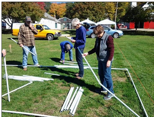
Reading the instructions!