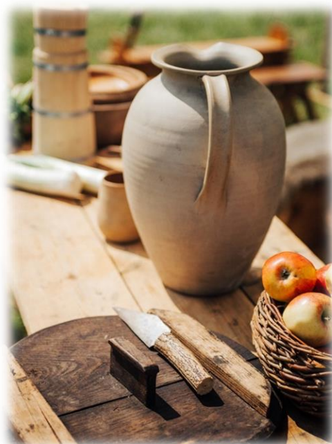
The Wedding at Cana

15 Cross Point Road, P.O. Box 113, Edgecomb, ME 04556 Phone: 207.882.4060 Email: edgecomb.church@gmail.com FB/EdgecombCongochurch