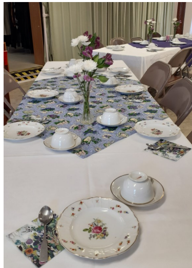
Lovely table settings