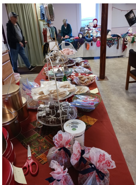
Baked Goods for everyone's sweet tooth abound