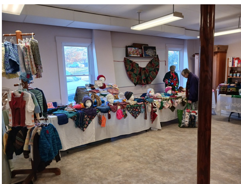
Busy Hands filled two tables with grand handmade items for everyone on your Christmas list.