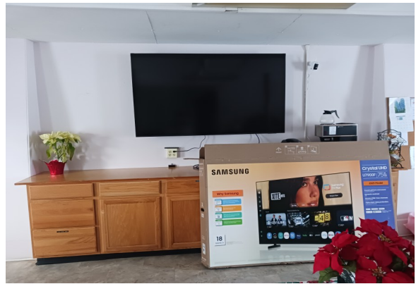
New LARGER TV screen in Parish Hall