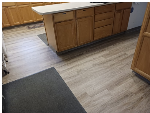
New Kitchen Floor