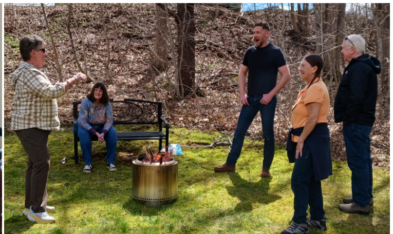
Nature Prayer Walk Sunday, April 26, around the bonfire.